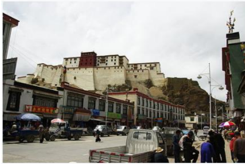
Nickname(s): Gateway to Everest

The Rinpungpa belonged to the Ger (clan, which is traced back to the days of the Tibetan Empire. One of their line, Namkha Gyaltsen, served as nanglon (minister of internal affairs) under the Phagmodrupa ruler Jamyang Shakya Gyaltsen, who held power over Ü-Tsang. He was appointed dzongpon (governor) of the fief Rinpung in Rong, a region in Tsang in an unknown year before 1373. His political position was strengthened by the marriage with the Phagmodrupa princess Sönam Palmö. Their daughter in turn was given in marriage to Sangye Gyaltsen, a Phagmodrupa prince, and gave birth to the later ruler Drakpa Jungne (r. 1432-1445). The son of Namkha Gyaltsen was Namkha Gyalpo who took over the Rinpung estate at the age of 14 and held a number of ministerial positions. He was succeeded in 1413 by his young son Norzang, a strong personality who expanded the fortunes of the family on a Tibet-wide level. He increased his control over territories in Shang, Tag, Ling and Kyur and was the patron of the Jamchen Monastery, founded in 1427. He also founded the Kyemotsal Monastery in Dzongkar in 1437.