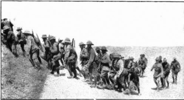
Marching 600 Miles Through Persia

given no other specific details about the mission, but those who accepted the call believed that no duty could be worse than spending another winter in the trenches of the Western Front. On 7 January, another request was sent to the brigade commanders, for the officers who volunteered for the mission to be immediately sent to see Currie personally. At Canadian Headquarters on 10 January, a parade was held and after interviewing each volunteer, 15 officers were selected. 53