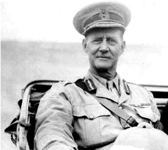
General Lionel Dunsterville in the Middle East

Still, there were other Allied interests in the area, specifically, the Dardanelles. The strategical advantage in this region, without going into lengthy detail, was the geographical benefit in transportation and trade: the Dardanelles connected the Mediterranean Sea to the Black Sea. The profits of getting through the Dardanelles were so obvious that Winston Churchill, then Lord of the Admiralty, planned a naval operation. On 18 March, under the direction of Major-General Sir Ian Hamilton, a combined British and French fleet assembled at the Dardanelles Strait and bombarded coastal defences. With no amphibious landings planned, the naval attempt to force the strait was unsuccessful and was aborted. 25 However, the plan to take