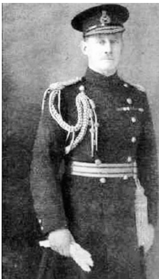
General Lionel Dunsterville

the Persian-Afghan border in order to safeguard the cities of Meshed and Ashkhabad, the latter being situated on Trans-Caucasia Railway. Major-General Sir George Macartney was placed in command of the third, and smallest, special force. His mission, operating further east, was to proceed via Chinese Turkestan (Kashgar) into Russian Turkestan to the city of Tashkent, again a vital stop along the railway. 43 However, Dunsterforce was given the most critical and dangerous assignment, as its zone of operation was closest to the Turkish threat and was under what the Russians labelled before the war "German orientation." 44